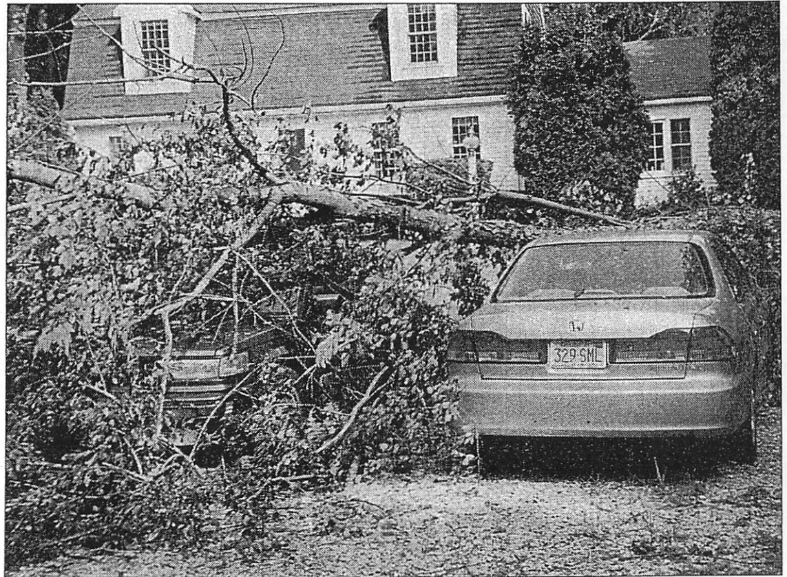
Camille Neville's car was damaged by a falling tree during Saturday night's storm, but her husband's car escaped unscathed.